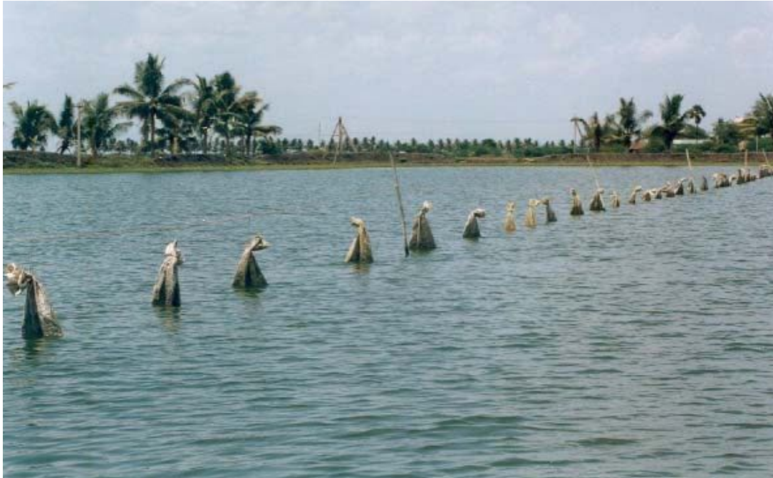
Plate 1: Suspended feeding bags in a fish pond [29]

and results in higher growth rates, improved feed ingestion rates, and higher retention rates [10].