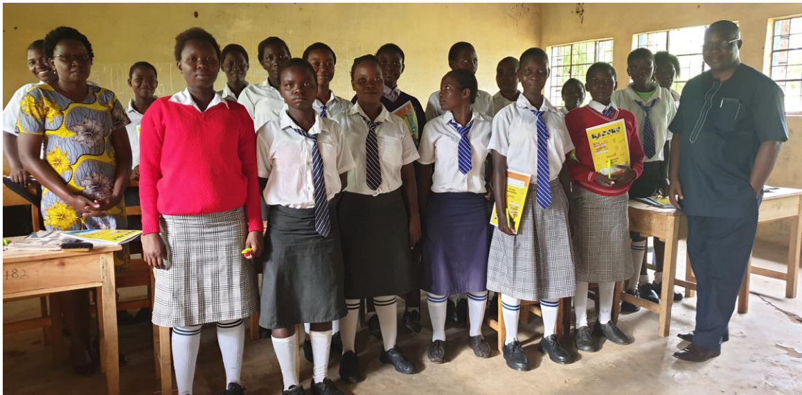
Figure 3: Gatue Day Mixed Secondary School