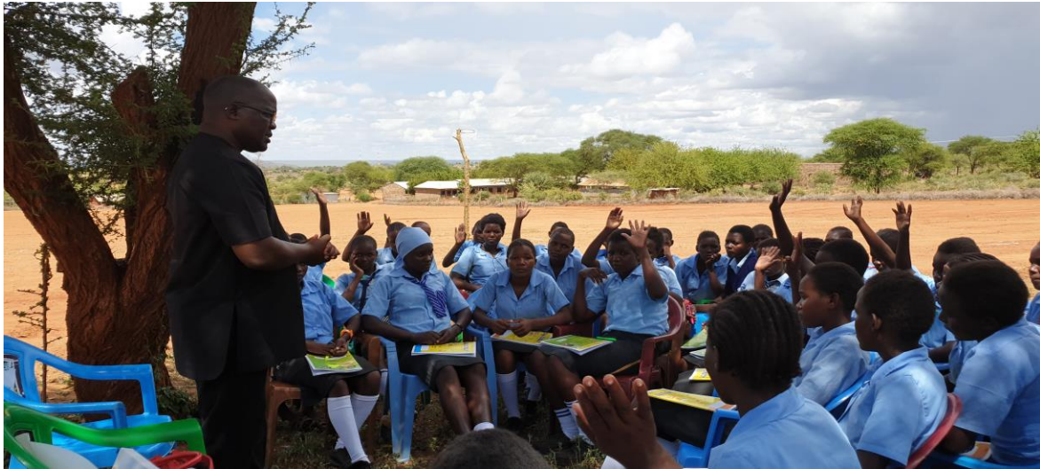
Figure 2: Kathangachini Day Mixed Secondary school