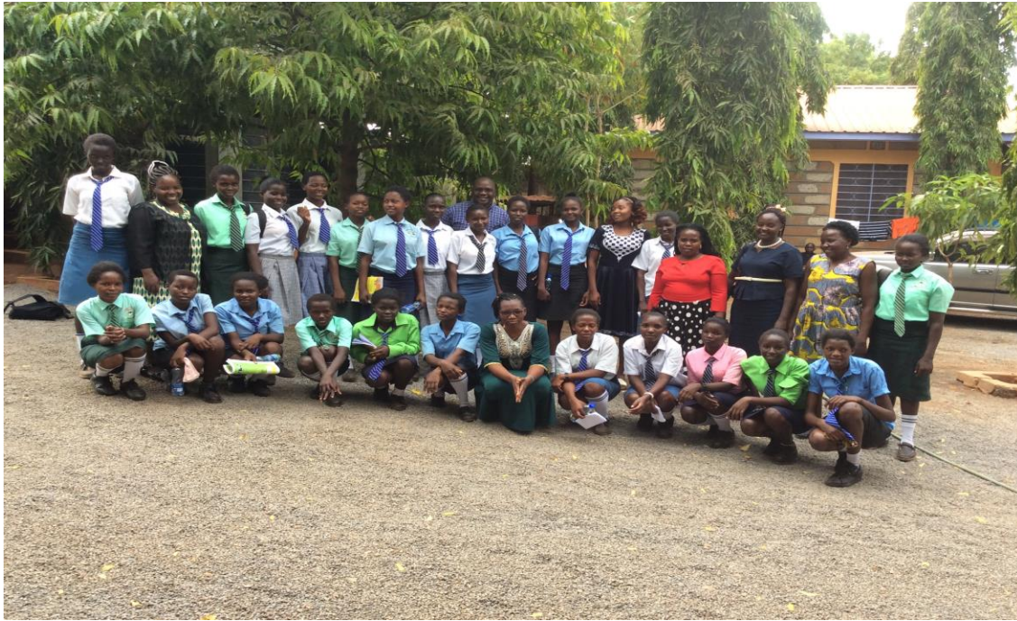
Figure 7: Representatives from the Five Schools during the Open Forum

The general idea in writing the narratives was to get the girls to tell their story; to share their recent experiences that is one week, month or two months ago. They were expected to keep a daily journal from when the clubs were formed which would be incorporated into their prior experiences when writing the narratives. The guidelines for writing used are consolidated in Table 1.