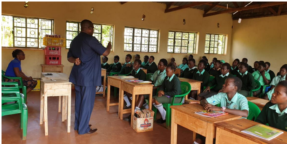
Figure 5: Kabuabua Girls' Boarding