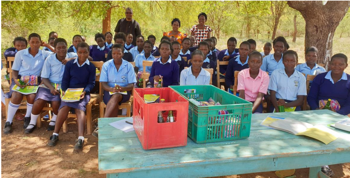
Figure 6: Gaciongo Mixed Secondary School

Data was collected through the clubs whereby, students shared their daily experiences, wrote stories based on these experiences and subsequently submitted them for analysis. This data was validated during the open forum where representatives from each school shared a summary of girls' experiences from their schools. Collectively, the girls proposed ways in which they thought the challenges could be overcome. Data was therefore gathered from three sets of narratives written by girls during the school literacy club meetings under the mentorship of the literacy club patrons and sharing of experiences by representatives from each of the five schools during the open forum, which was done at the end of the project.