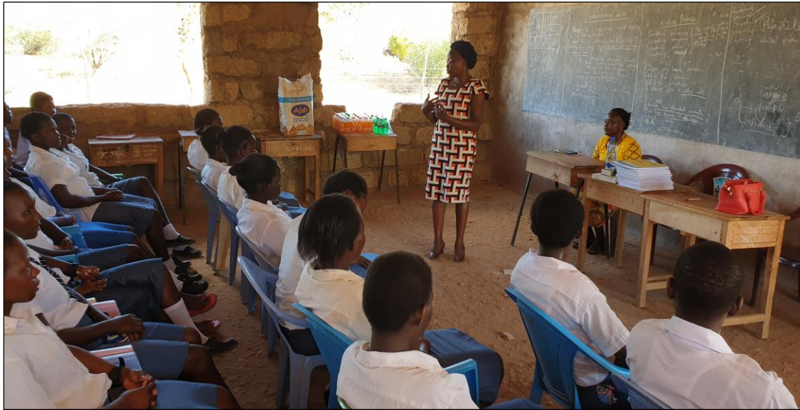
Figure 4: Kamacabi Day Mixed Secondary School