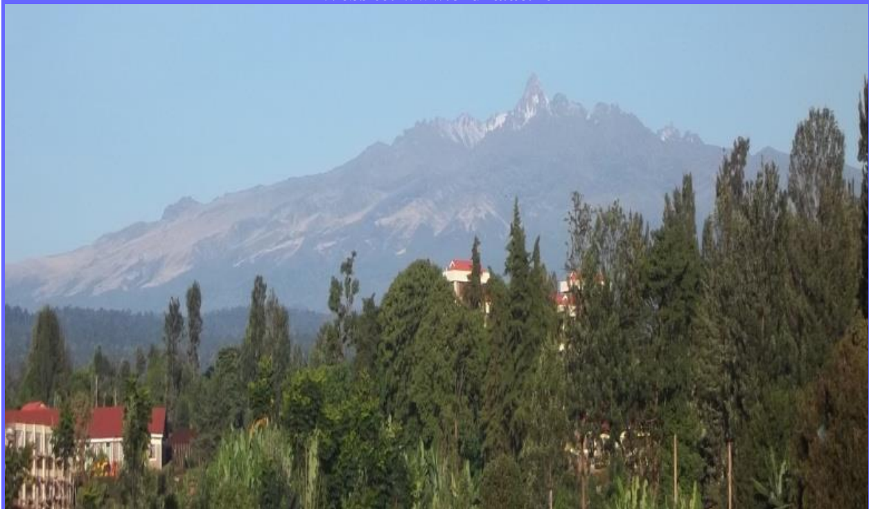
Chuka University is located near Mt. Kenya in the background